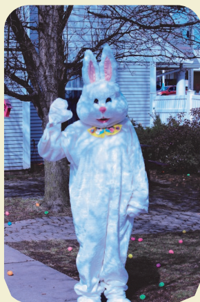
The Easter Bunny is ready for children to collect eggs!

The weather was brisk, but pleasant enough to scatter over 500 eggs in our courtyard with special prizes and treats for all!