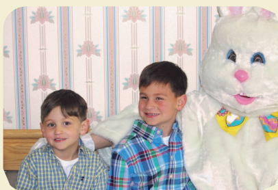
Children are very happy to see the Easter Bunny!