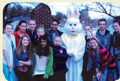
East Windsor High School Volunteers helped the Easter Bunny scatter eggs!